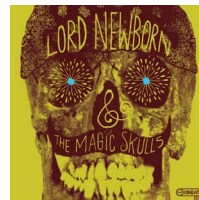
LORD NEWBORN & THE MAGIC SKULLS CD/DLP