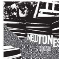
NOMO NEW TONES CD/LP