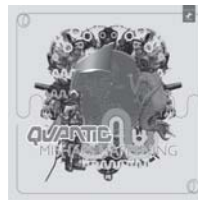
QUANTIC MISHAPS HAPPENING CD/DLP